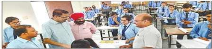
विश्व पर्यटन दिवस पर केएनआई में आयोजित कार्यक्रम में प्रतिभाग करते विद्यार्थी।